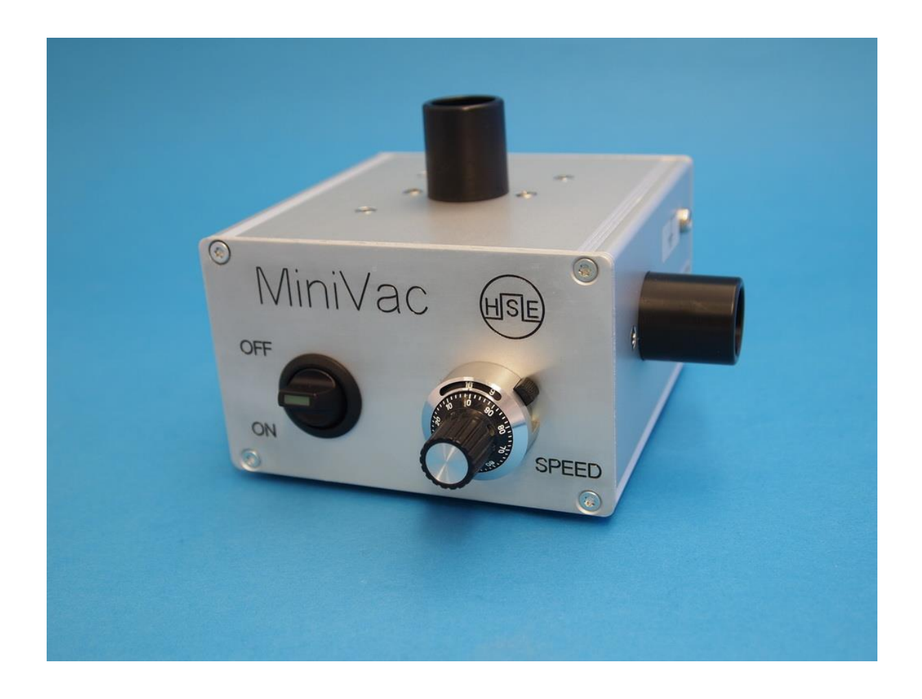
Not For Human Use!!